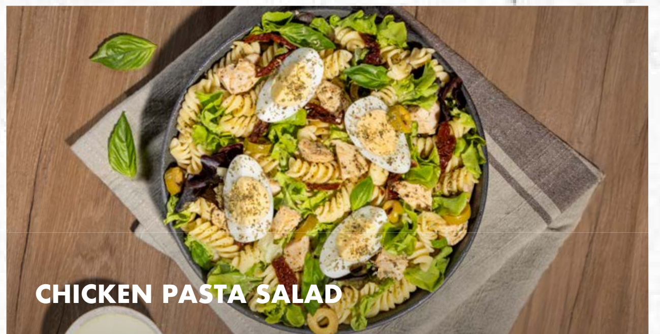
CHICKEN PASTA SALAD

A hearty mix of pasta, greens, chicken, green olives, sun-dried tomatoes, and fresh basil, topped with a boiled egg and a sprinkle of dried oregano. Served with our signature honey garlic dressing