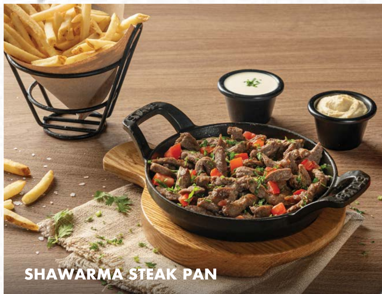
SHAWARMA STEAK PAN