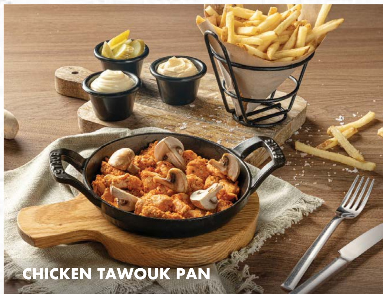
CHICKEN TAWOUK PAN

Juicy chicken breast grilled to perfection mixed with fresh mushrooms. Served with thin-cut fries, crunchy pickles, garlic sauce and our homemade hummus dip