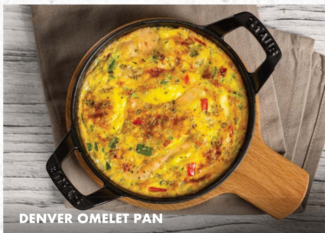
DENVER OMELET PAN

Pesto sauce, mozzarella, zucchini, feta cheese, black olives, hot green pepper, cherry tomatoes, arugula & freshly cut onion with olive oil on top